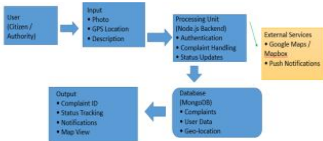
Figure 2 Technology Stack

The implementation utilizes modern technologies to ensure scalability and performance: