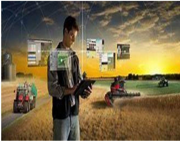
Fig.4. Data analytics

data. In their trends, analyzes to know the harvesting period and also it knows their quality of crops. We can know the fertility and also volumes of the lands quality.