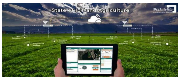
Fig.1. Climatic condition

Climate change can disturb food availability, reduce way in to food and affect the food quality. [5-9]