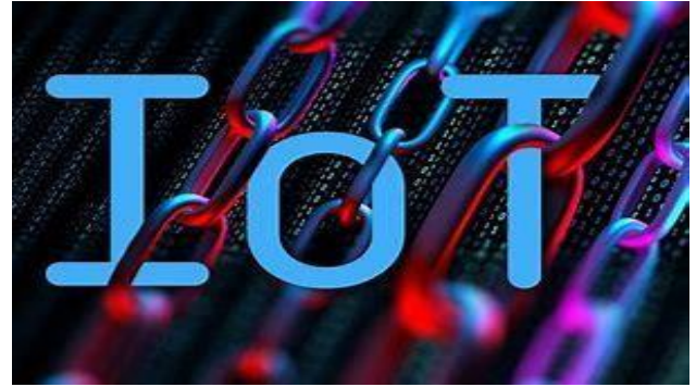
Fig.6. Internet of Things

In our future, IOT can change the humanity and also changes the whole planet of the earth. It will monitor the soil deteriorating. This technology can be used to predict our future because 9 billion peoples will be increased in 2050. This is the best method to manage our future generations.