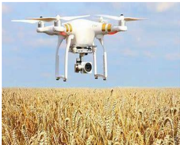
Fig.5. Agricultural drone

Agricultural drone is the most advance application of these trending technologies. Aerial drones are used for crop monitoring planting, spraying and field analysis. Drone technology can give the proper strategy in agricultural industry. Drones have multispectral sensors to identify the changes in irrigation and also it calculates the vegetation index and reduces the environmental impact.