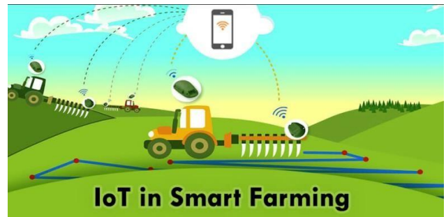
Fig.2. Precision farming