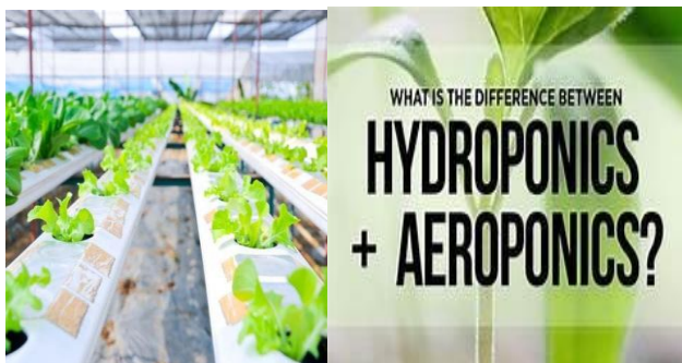
Fig.8. Autonomous green house

This technology uses sensors to monitor the LED lights Carbon-dioxide level humidity and analysis the data to make a sustainable environment. This technology are mainly adopted with hydroponic and aeroponics to make a larger crop growth production. While these techniques can develop a large amounts fruits and vegetables with a good nutrition and also it can build the future of IOT in agriculture.