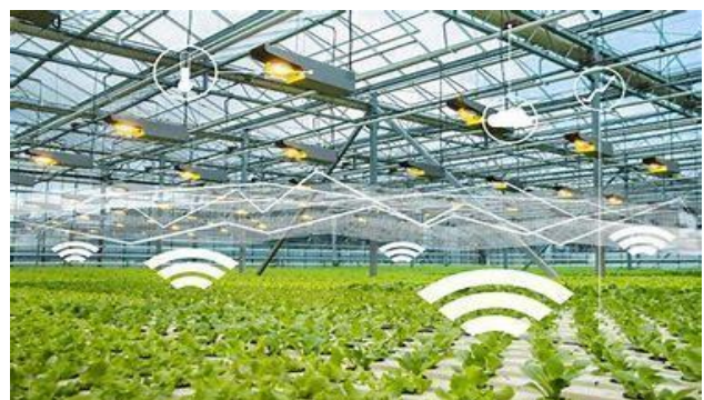
Fig.3. Smart greenhouse

Smart green house has been enables to detect the climatic conditions instantly to given a particular instruction. In adaptation of these technologies, green house has been eliminated the human intervention and also it make a costlier efficiency. It can collect the data from the green house by using sensor very precisely. While this technique can send the information through via email or SMS alerts.[10-12]