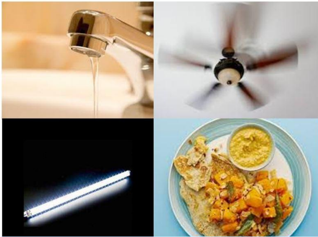
Fig.3. Energy Loss