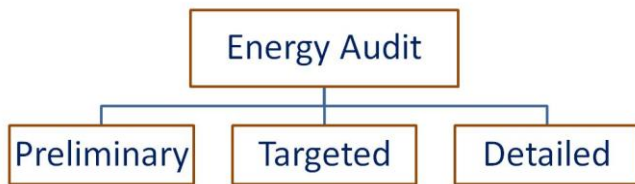
Fig.1. Energy Audit Types