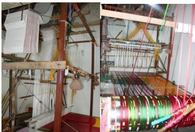
Fig.3. Setting up of Loom

Setting up the loom to weave material takes an entire day to set up the loom. At the point when the plan and structure of the material had worked out, the shafts and pedals have tied up in the right manner to accomplish that specific weave structure. Warp beam preparation was the longest portion of the setting up the weave. Each end was separately strung through a heddle which holds tight a shaft.