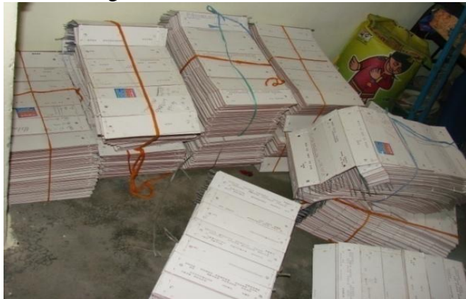
Fig.2. Punch Cards

necessary arrangement. These cards, connected in a chain according to the plan, at that point utilized by the jacquard machine to give the specific succession of the various shades of the strings that were needed for the plan. The jacquard machine has a rectangular square pedal on which the chain of punch cards runs. These cards have various examples of openings. The Jacquard loom was constrained by punched cards with punched holes, each row of which relates to one line of the plan. The punch cards used in weaving process was shown in Figure 2.