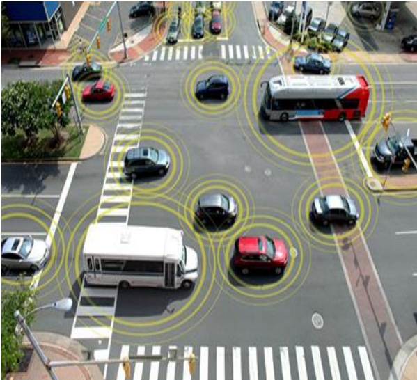
Fig.1. Identifying nearby vehicles

interchanges to achieve success, not normal for radar. So, if a vehicle before of you is slowing down hard on the other side of a slope thanks to a deterrent, you'd get a warning despite the very fact that you just can't see and do not realize the hazardous circumstance creating. [7-12].