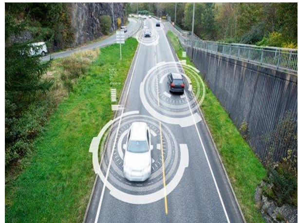
Fig.3. Showing the scope of the Vehicle

organizations, to empower a scope of abilities. For instance, car IoT empowers rapid vehicle-to-vehicle and vehicle-to-framework correspondences to trigger the accompanying outcomes, huge numbers of which are conceivable today: