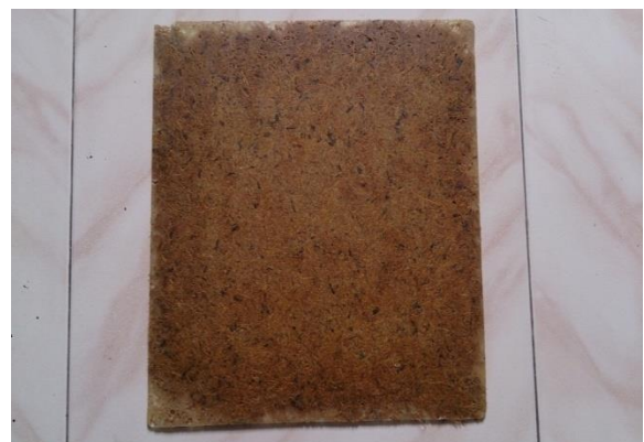
Fig. 6 Alkali Treated Coir Fiber Reinforced Epoxy Composites Particle Board

Size of the practical board in 300x300mm and thickness is 3mm