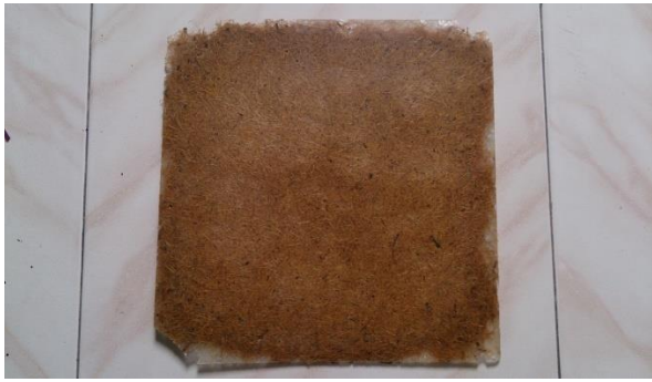
Fig.7 Acetylation Treated Coir Fiber Reinforced Epoxy Composites Particle Board