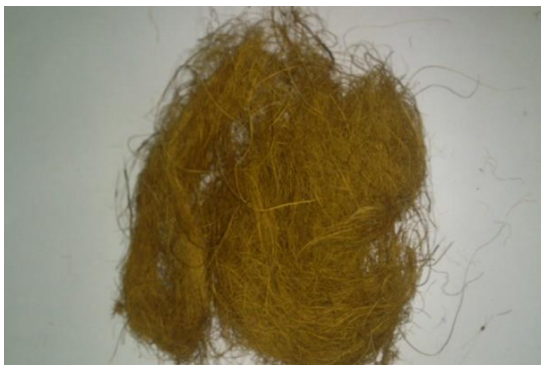
Fig. 3 Alkali treated fiber