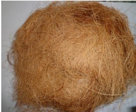
Fig. 2 Untreated coir fiber