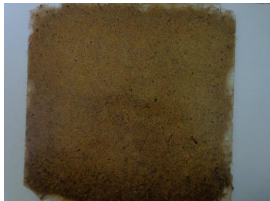
Fig. 5 Untreated Coir Fiber Reinforced Epoxy Composites Particle Board

The mixing ratio is based on the composite weight percentage. Size of the practical board in 300x300mm and thickness is 3mm.