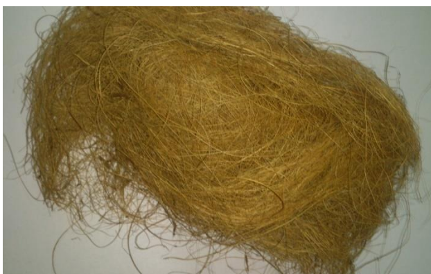
Fig. 4 Acetylation treated fiber