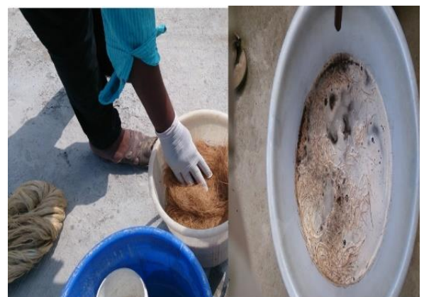
Fig.1 Alkali Pre-treatment process

It is sometimes performed on short fibers, by heating at approx. 80 C in tenth NaOH aqueous solution for about 3.5 –4.5 h, washing and drying inventilated oven. It permits disrupting fiber clusters and getting smaller and higher quality fibers. It ought to conjointly improve fiber wetting. Alkali Pre-treatment process shown in fig 1. Untreated coir fiber shown in fig 2. & Alkali treated fiber shown in fig 3. Acetylation treated fiber shown in fig 4.