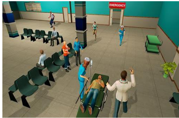
Fig.3. Reduce the Waiting Time