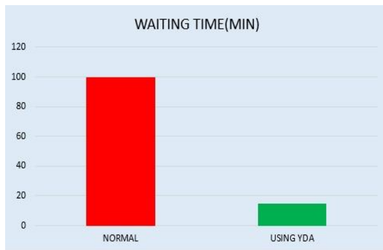
Chart.1. Waiting Time Analytics

We are using data analytics technique to get the appointment details in every hospital for our web-application. The hospital appointment data for the past 10 years has been collected; this will be helpful in predicting the future appointments. If a disease is spread among 10 members in a city, there is a future prediction that the disease is widely spread among the particular area. So the patients from that city can be given awareness about the vulnerable disease.