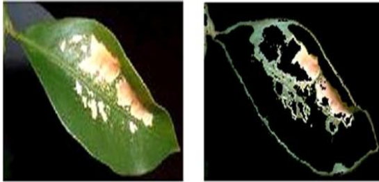
Fig. 2 Removing masked Region

4. Remove the masked, and then we can get the segment of the disease part. In figure 3 we can see the result of the leaf of lemon after removing the masked area.