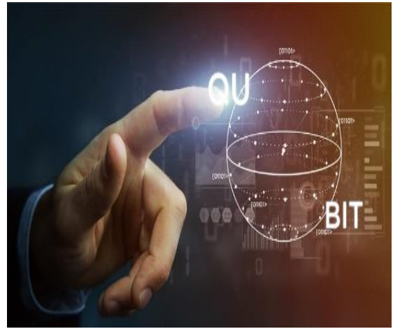
Fig.1: Applications of Quantum Computing

There are some areas of application which are suitable with respect to quantum computing to study, research, investigate and survey. It depends on how the Organizations or enterprising entities engaged in commercial, industrial, or professional activities can take expedience of this advancement in quantum computing. One of the area's most people who are associated with is the advanced cryptography where the classical computers are impractical to break the cipher text that uses very huge prime decomposition. With the quantum computers it is faster and feasible to protect the digital lives and assets. Another area is Aviation where the Quantum skills, methods, and processes enable much more complicated Computer simulations that are run according to such programs which can produce knowledge out of reach of mathematical analysis or natural experimentation like aeronautical scenarios or outline which helps in the routing and scheduling of aircrafts having immense trading benefits for time and costs.[5-8].