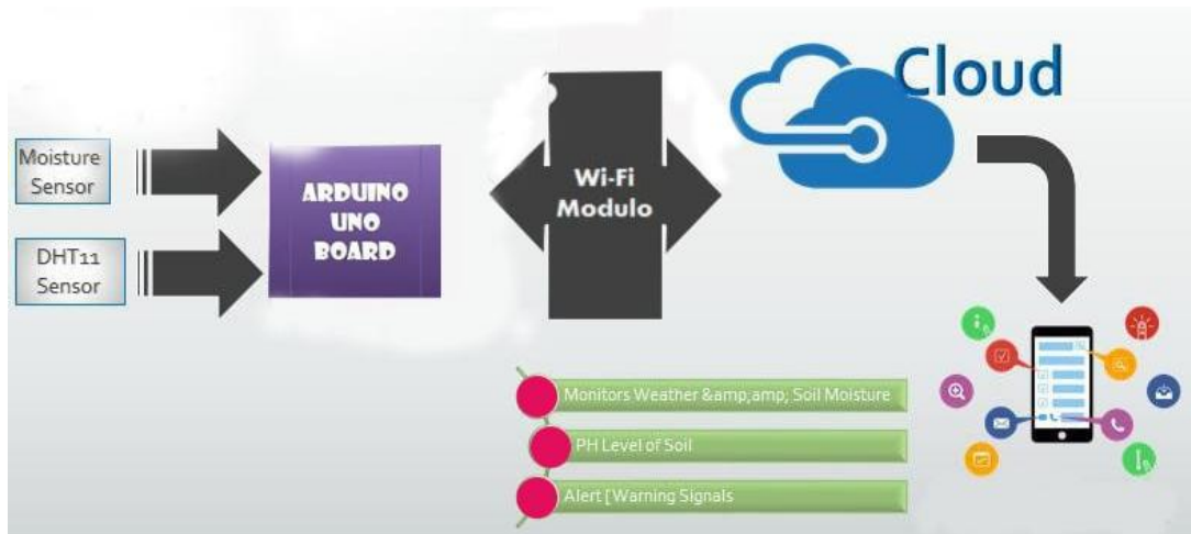
Fig.1: System Design

which helps to manage the farming land. The Wi-Fi module (ESP2866) with embedded sensors provides the raw data from the farmland and then cloud technology is used for gathering the information and sends these data to compare it with the database. In this process, the enormous set of data is collected from the farmland and transferred to the application has been analyzed and all possible results will be displayed.